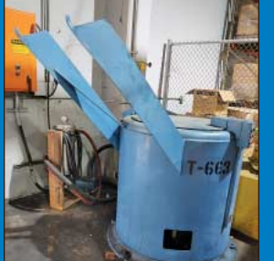
Barrett Chip Wringer