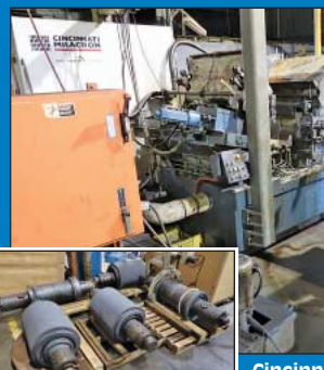
Cincinnati Milacron Model 350-20 RK Series Centerless Grinder