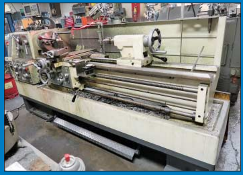
16" x 60" Vectrax Model DX410-1500G Engine Lathe w/ DRO