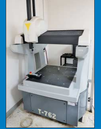
Brown & Sharpe Model One 7.7.5 CNC Coordinate Measuring Machine