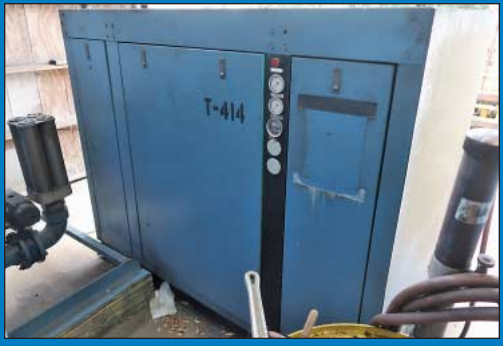
200-HP Sullivan Palatek Model 200GC Rotary Screw Air Compressor