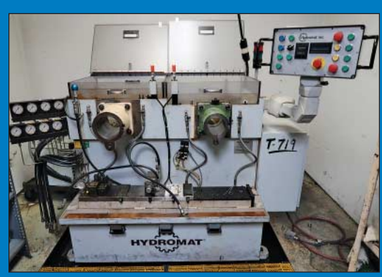
Hydromat Two-Station Test Stand