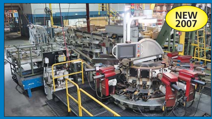
Hydromat Model Epic R/T HS16 16-Station Rotary Transfer Machine