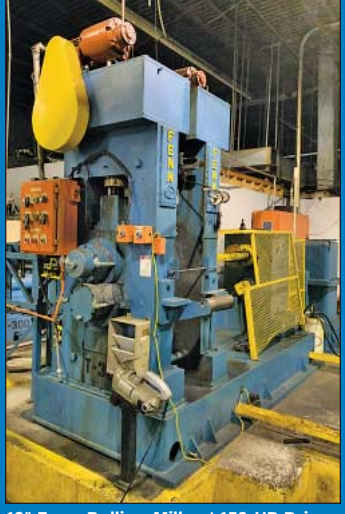
12" Fenn Rolling Mill w/ 150-HP Drive