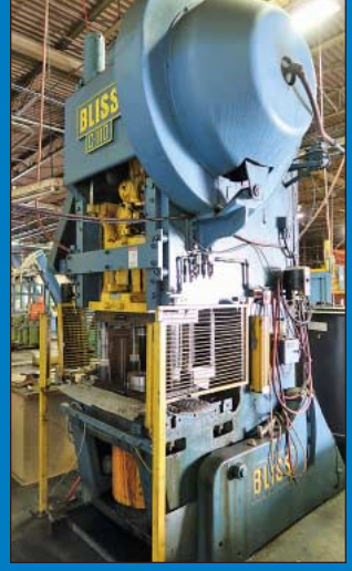
110 Ton Bliss Model C110 OBI Press