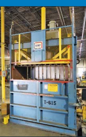
30" x 72" KMF Model HL720L Vertical Hydraulic Baler