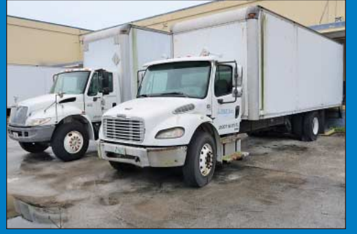
(2) Freightliner Business Class M2 Gasoline Powered Tandem Axle 25' Box Trucks