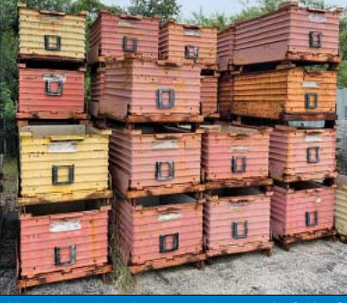
(60+) 30" x 48" x 24" Deep Corrugated Steel Hinge Bottom Bins