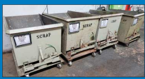
(25) Self Dumping Hoppers