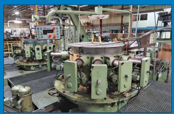
Hydromat Model HB32/45 16-Station Rotary Transfer Machine