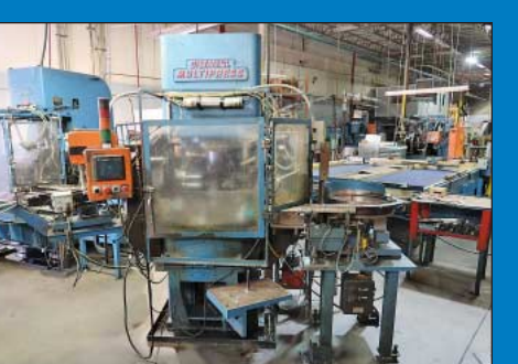
35 Ton Denison Model LA35 C-Frame Hydraulic Press w/ Index Table