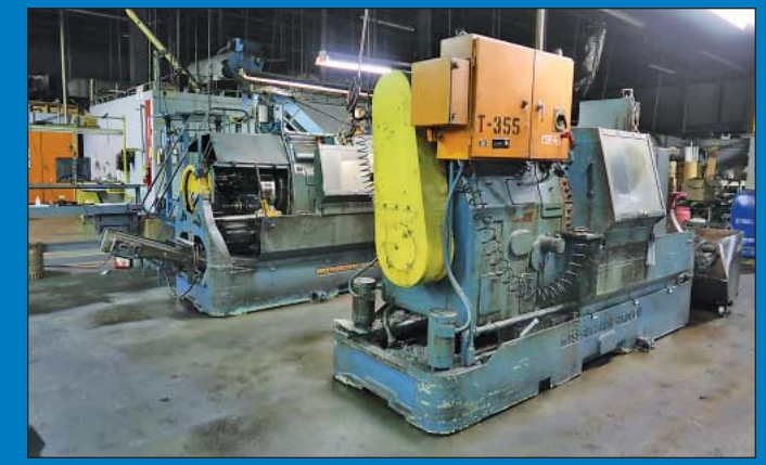
(8) 1-5/8" Acme-Gridley & Mitsubishi-Acme 8-Spindle Chuckers

Machines for Various Machining Operations