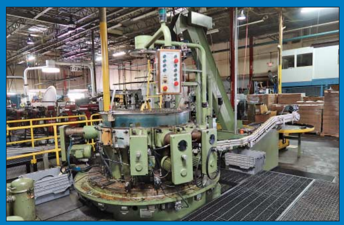
Hydromat Model HB45 12-Station Rotary Transfer Machine