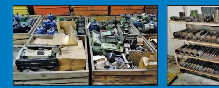
Hydromat Tooling, Parts and Accessories

Hydromat Model HB45 12-Station Rotary Transfer Machine; s/n 180286-33