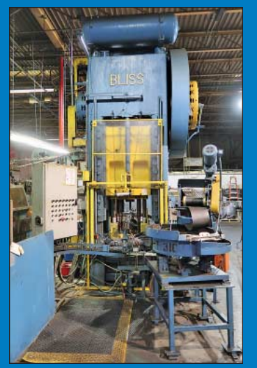
200 Ton Bliss SSSC Press