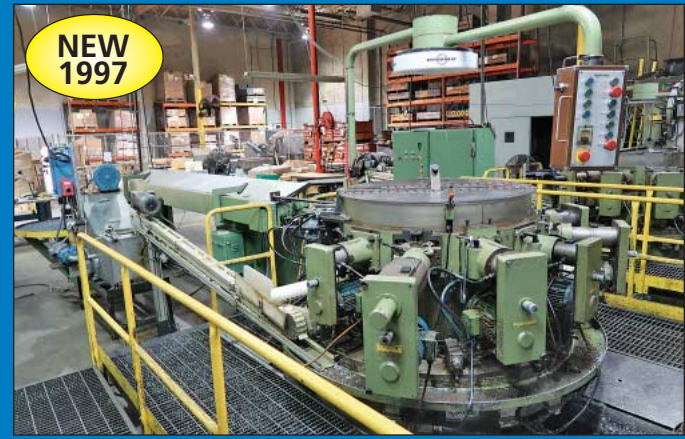
Hydromat Model HB45 12-Station Rotary Transfer Machine