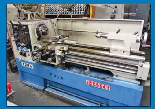
14" x 40" Acra Model 1440TE Engine Lathe w/ DRO