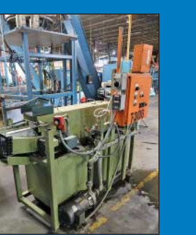
(5) Single Stage Machine Side Parts Washers by Stoelting and Others