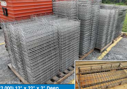
(2,000) 12" x 22" x 2" Deep Stainless-Steel Wire Frame Parts Travs