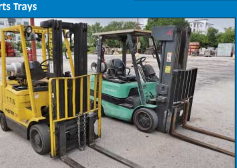
(4) 5,000 Lb. Mitsubishi & Cat Model FGC25 LP Gas Solid Tire Lift Trucks w/ 3-Stage Mast