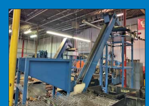
Various Parts Loaders