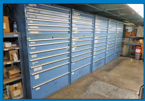
Tooling Cabinets w /Parts