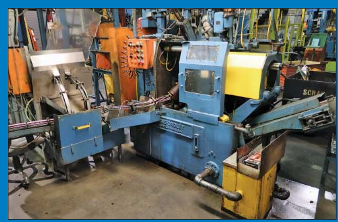
(8) 2-3/8" Acme Model HSC6 Chuckers Set-up in Cells w/ Vib Bowls & Conveyors